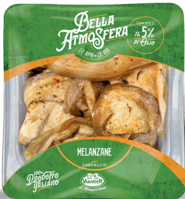
Aubergine carpaccio code 06049 Tray 1/6-750g