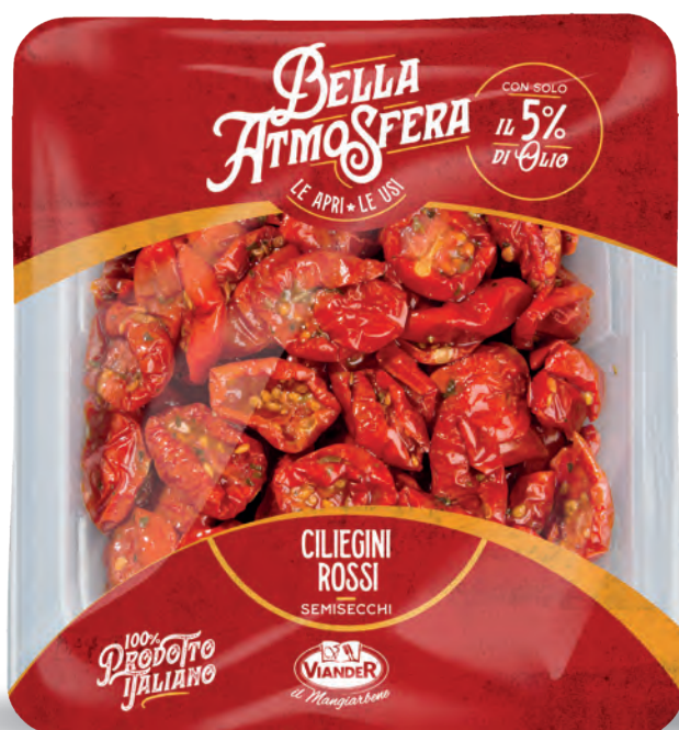
Semi-dried cherry tomatoes code 06021 Tray 1/6 - 750g