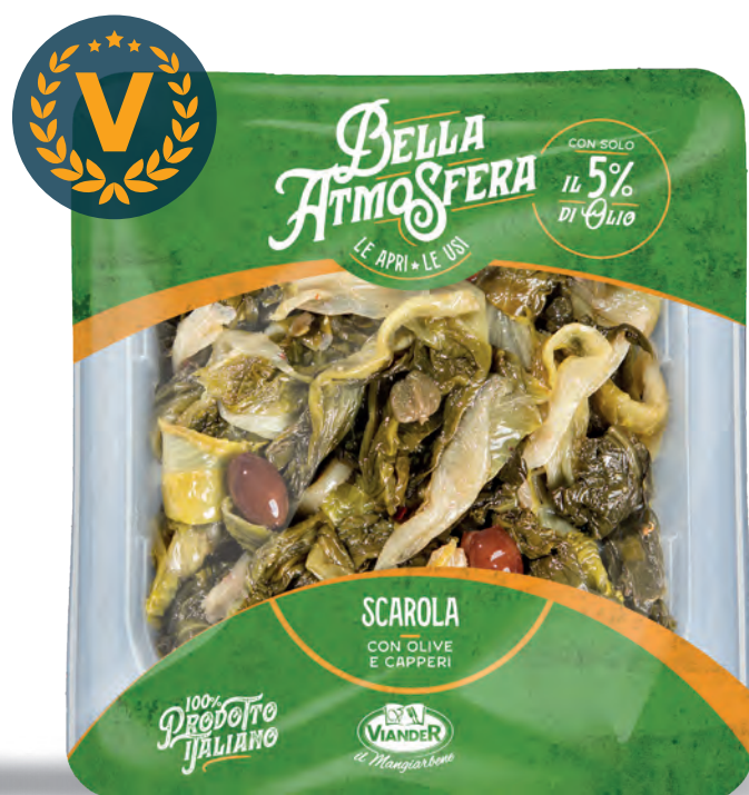
Endive with capers and olives code 06037 Tray 1/6 - 950g