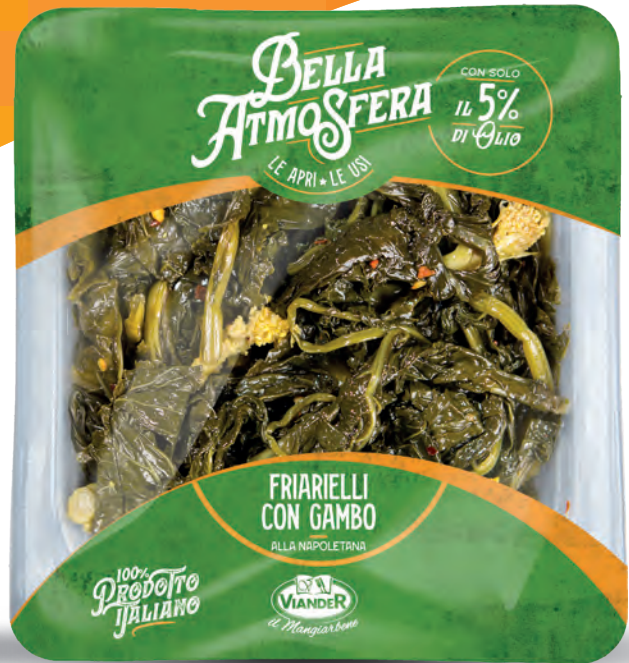
Neapolitan turnip greens code 06036 Tray 1/6 - 950g