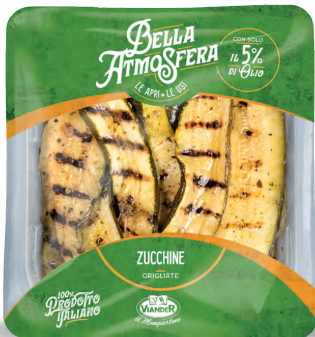
Grilled courgettes code 06041 Tray 1/6-950g