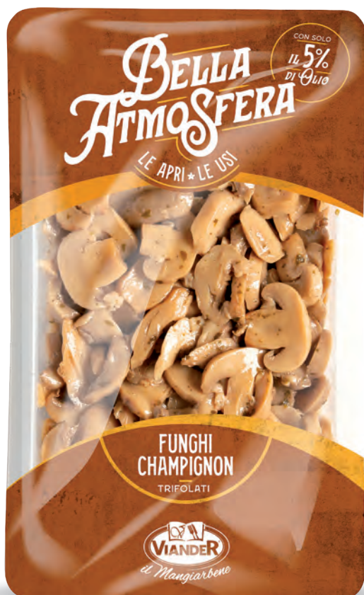
Sautéed Champignons mushrooms code 06014 Tray 1/4 - 1500g