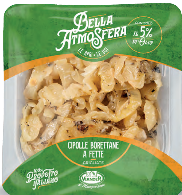
Grilled sliced Borettane onions cod. 06050 Tray 1/6 -950g