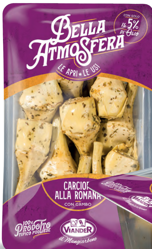
Romana artichokes with stem code 06004 Tray 1/4 - 1200g