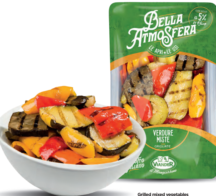
Grilled mixed vegetables code 06034 Tray 1/4 - 1500g