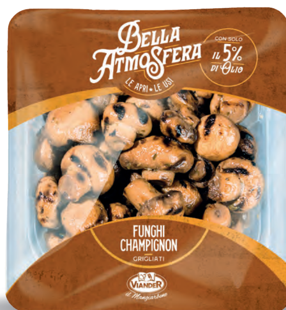
Grilled Champignon mushrooms code 06016 Trat 1/6-750g