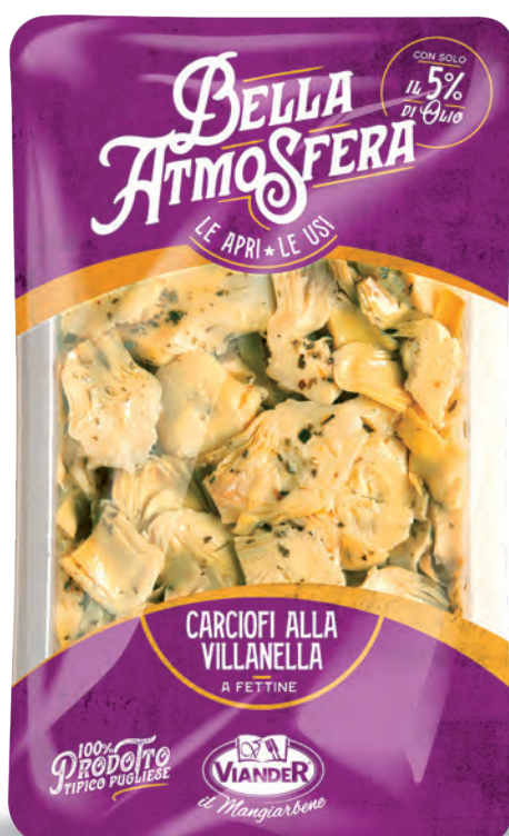
Villanella sliced artichokes code 06005 Tray 1/4 - 1500g