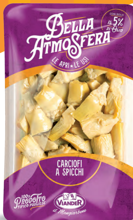
Artichoke quarters code 06006 Tray 1/4 - 1500g