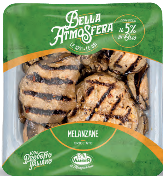
Grilled aubergines code 06040 Tray 1/6- 950g

We know the raw material inside out and we enhance it with recipes that are faithful to the Italian tradition.