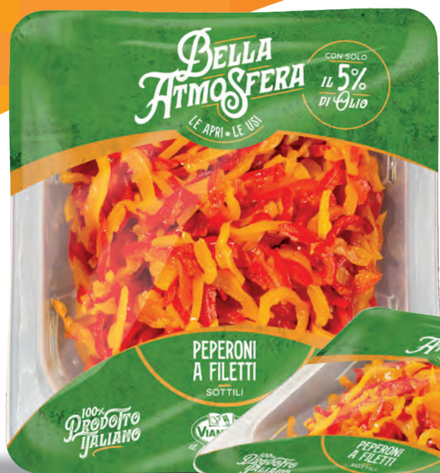
Pepper strips code 06047 Tray 1/6-950g