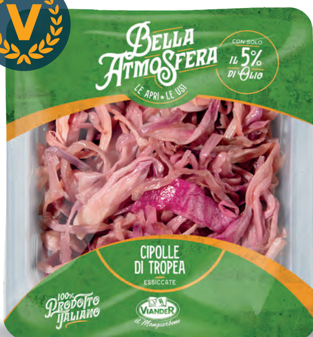
Dried Tropea onions code 06052 Tray 1/6-950g