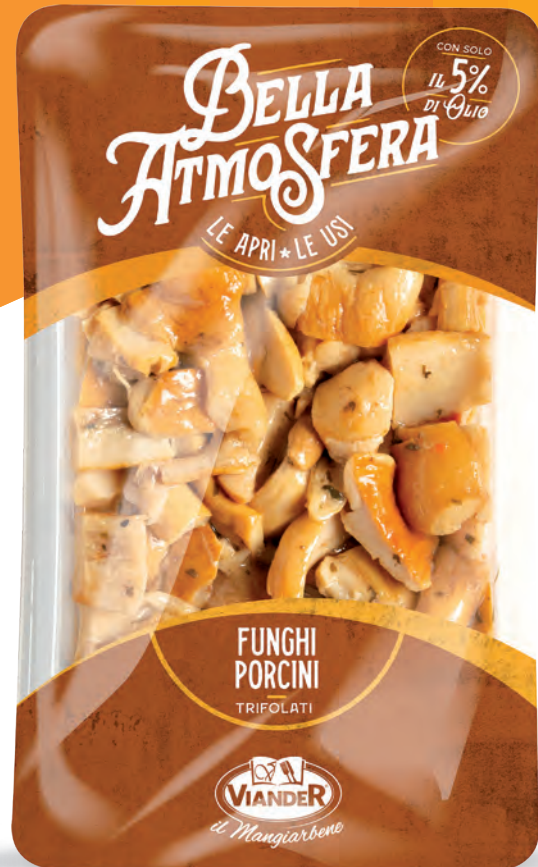
Sautéed Porcini mushrooms code 06013 Tray 1/4 - 1500g