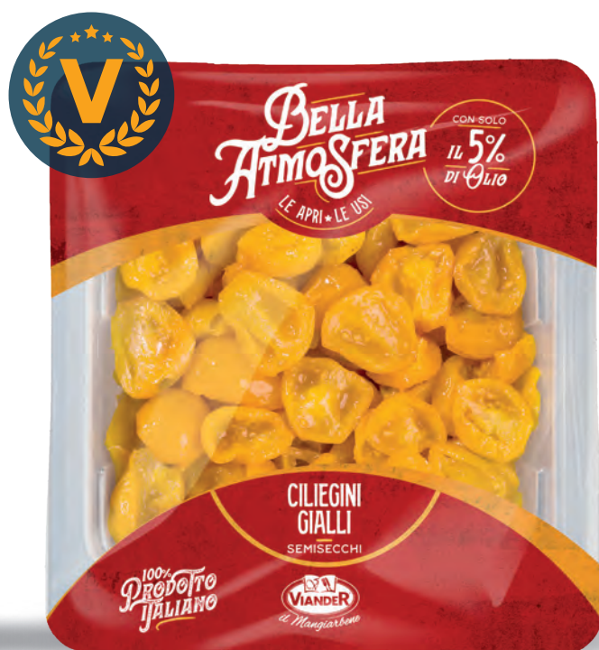
Semi-dried yellow cherry tomatoes code 06022 Tray 1/6 - 750g