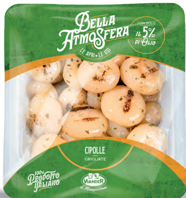
Grilled onions code 06051 Tray 1/6-750g