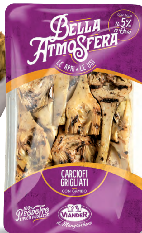
Grilled artichokes with stem code 06002 Tray 1/4 - 1200g