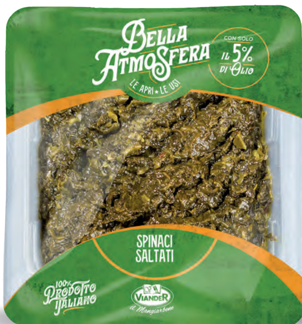
Sautéed spinach code 06038 Tray 1/6 - 950g