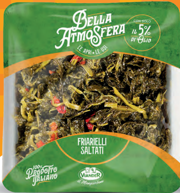
Sautéed turnip greens code 06035 Tray 1/6 - 950g