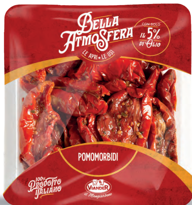
Semi-dried tomatoes code 06025 Tray 1/6 - 750g