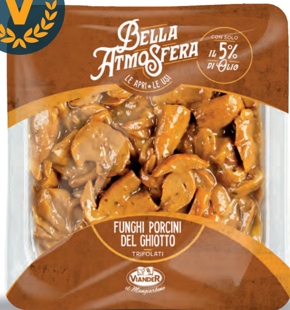
Porcini mushrooms with garlic and parsley "Del Ghiotto" code 06017 Tray 1/6 - 950g