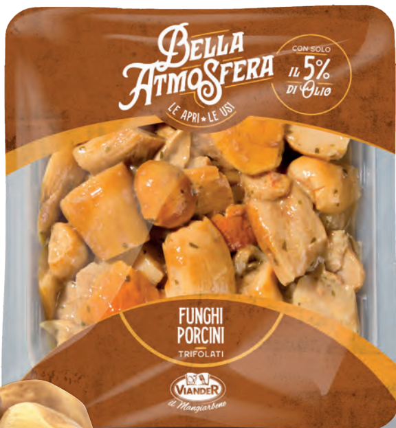
Sautéed Porcini mushrooms code 06011 Tray 1/6 - 950g