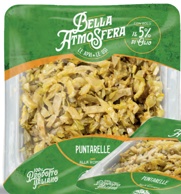
Roman style Puntarelle "chicory" code 06044 Vaschetta 1/6- 750g