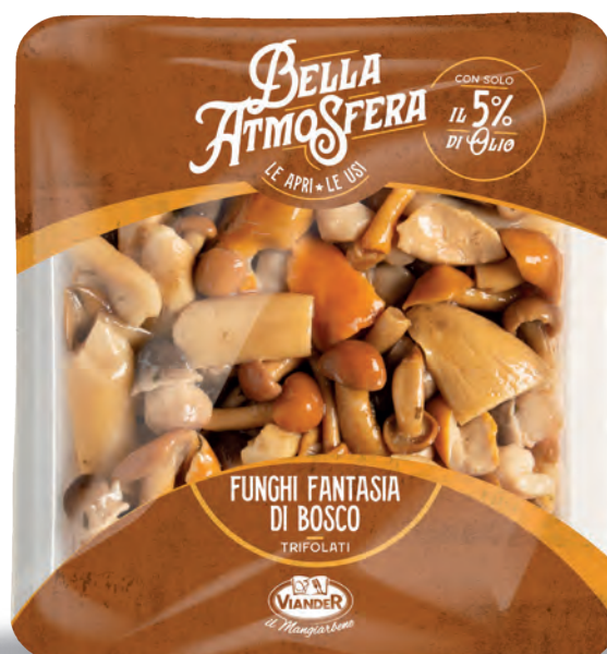
Sautéed mushrooms (4 mixed varieties) code 06010 Tray 1/6 - 950g