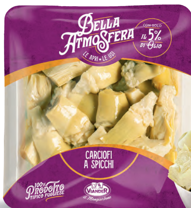
Artichoke quarters code 06001 Tray 1/6 - 950g