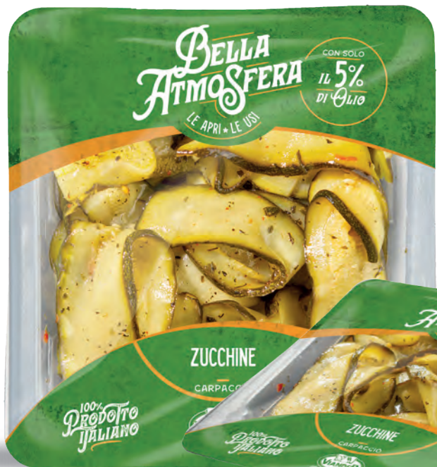
Courgette carpaccio code 06048 Tray 1/6-950g