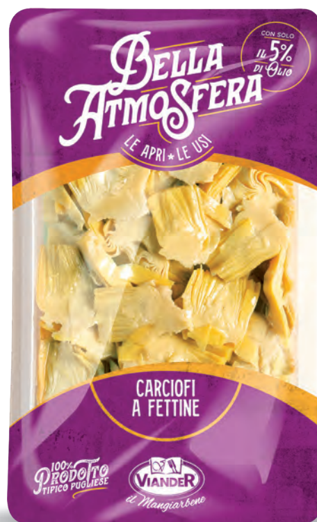
Sliced artichokes code 06007 Tray 1/4 - 1500g