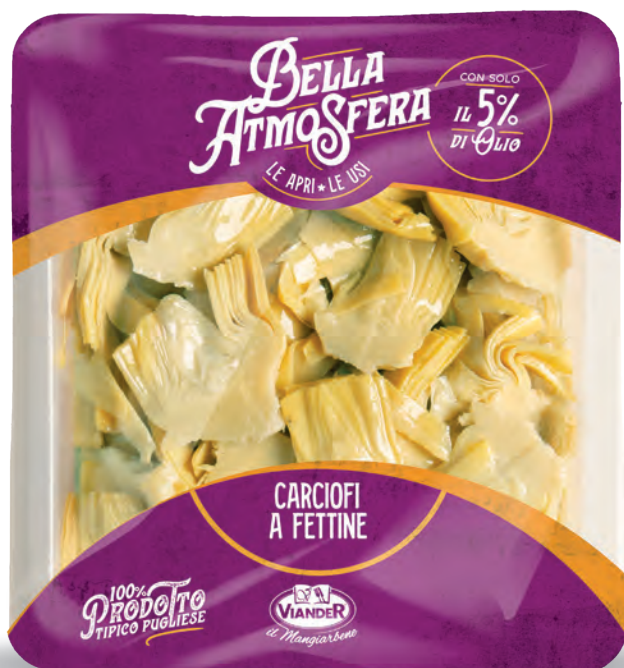
Sliced artichokes code 06003 Tray 1/6 - 950g