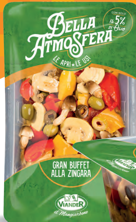
Zingara mixed vegetables code 06031 Tray 1/4 - 1500g