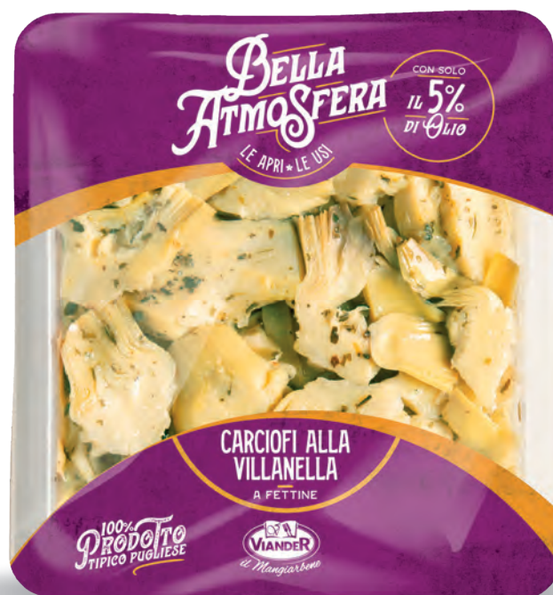
Villanella sliced artichokes code 06000 Tray 1/6 - 950g