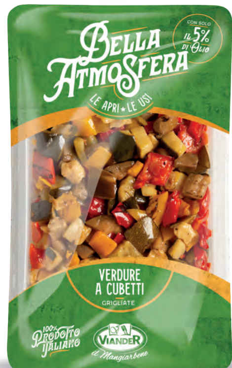
Grilled diced vegetables code 06033 Tray 1/4 - 1500g