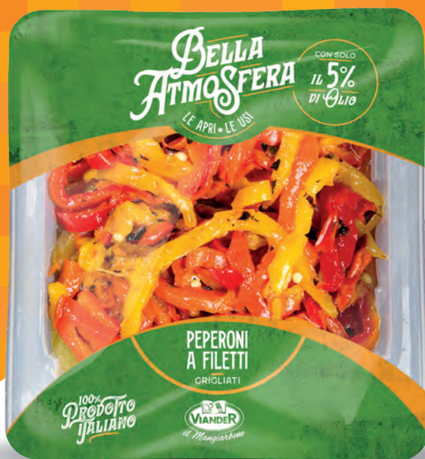
Grilled pepper strips code 06046 Tray 1/6 - 950g