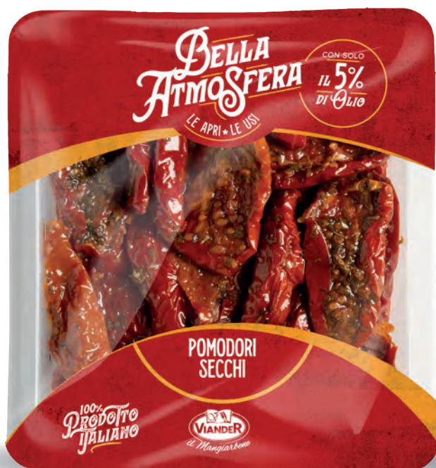
Dried Tomatoes code 06020 Tray 1/6 - 750g