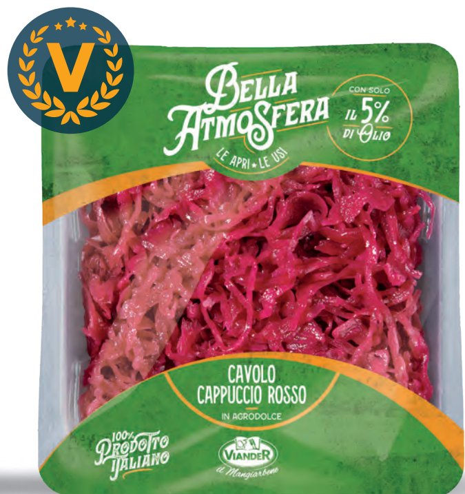
Red cabbage cod. 06055 Tray 1/6 - 750g