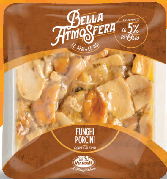
Sautéed Porcini mushrooms with sauce code 06012 Tray 1/6 - 950g