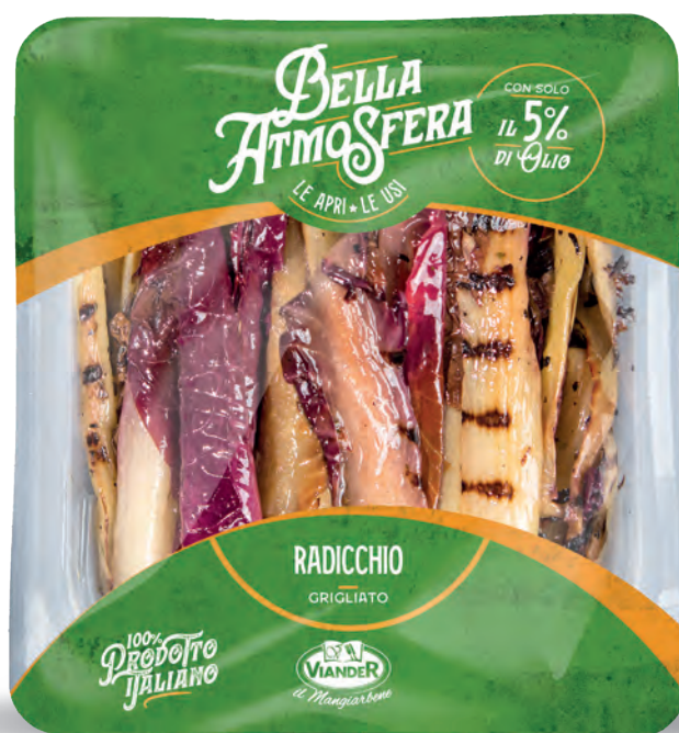
Grilled Trevisan chicory code 06045 Tray 1/6 - 950g